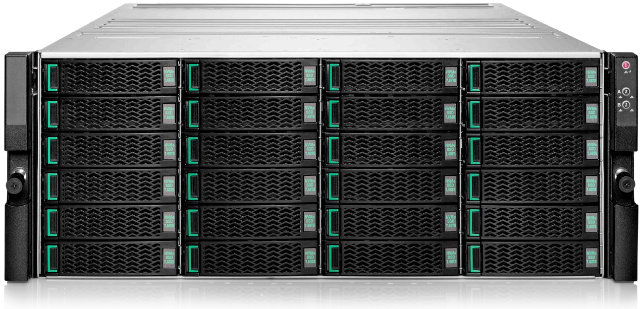
HPE Alletra Storage 6000 array (Base array, 4U; 24 bays with NVMe SSDs)